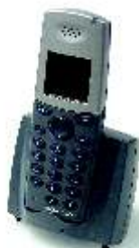
DECT Phone D300

The SwyxPhone S315 is the cost-saving entry-level variant for utilizing all the advantages of SIP telephony. The SwyxPhone S315 combines classic design and the latest technology with an outstanding price/performance ratio. Using the SwyxIt! telephony client, a SwyxPhone S315 can be controlled with ease: e.g. dialing from phonebooks or caller lists, from Microsoft® Outlook or other applications. The startup and maintenance of the SwyxPhone S315 is easy: an installation wizard helps you with a fast startup for the phone. Further configuration can be carried out easily via the Web interface.