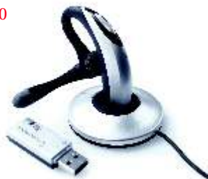
SwyxIt! Headset H390

SwyxWare's cordless DECT-over-IP solution makes staff accessible throughout the company location. Users of a Swyx IP-DECT telephone are fully integrated into SwyxWare, including the signaling of their status to other users. So the DECT-over-IP solutions are ideal for employees who are in scattered warehouses or production sheds.