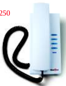
SwyxIt! USB Handset P250